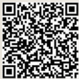
Dixon Customer Service