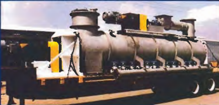
Unit for Recycle Paper