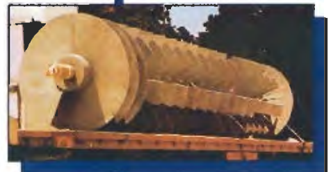
Heater Screw after Sandblasting