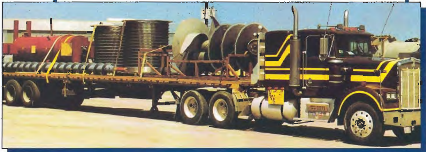
Rebuilt Separator Screw To Fit Screen

LIMITED WARRANTY: KWS warrants all equipment manufactured by KWS to be free from defects in material and manufacture at the time of shipment for a period of one (1) year from the date of shipment. KWS will furnish without charge, but will not install, replacements for such parts as we find to have been defective. Unless otherwise stated in quotation, this limited warranty is based on operation of the equipment for a period not exceeding eight hours per day. KWS MAKES NO OTHER WARRANTY OF ANY KIND AND HEREBY DISCLAIMS ALL WARRANTIES EXCEPT THE LIMITED WARRANTY HEREBY STATED, BOTH EXPRESS AND IMPLIED, INCLUDING THE WARRANTIES OF MERCHANTABILITY AND FITNESS FOR A PARTICULAR PURPOSE. All warranty claims must be submitted within ten (10) days of discovery of defects or shall be deemed waived. No representative of our company has any authority to waive, alter, vary or add to the terms hereof without prior approval in writing.