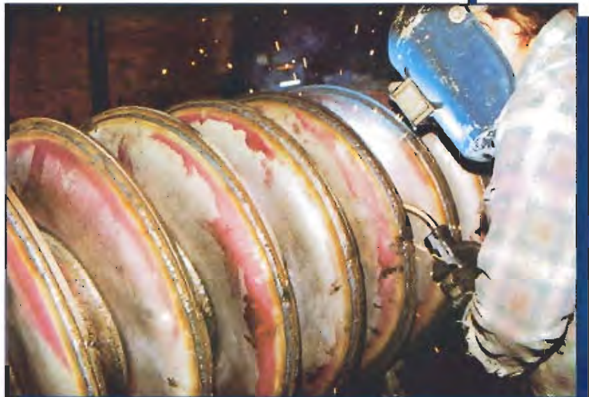
Hollow Flight Screw for Heating or Cooling Application