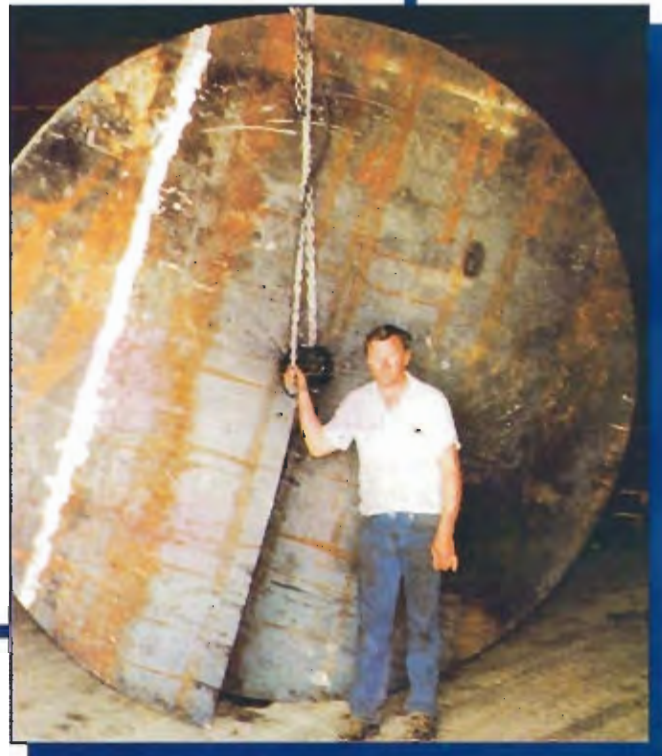
120" dia. Mild Steel Sectional Flight x 1" thk. Formed at KWS