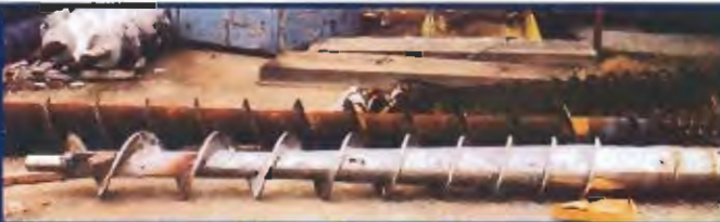
Thumne Dewatering Press Repair & New

From Timber to Paper "The Leader in Screw Conveyor Technology." Screws for Every Paper Mill Application. Supplier of Replacement Parts for Owners of All Triad Equipment.