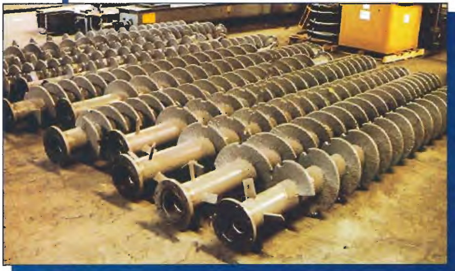
Bark Bin Screw w/Hard Surface Overlay