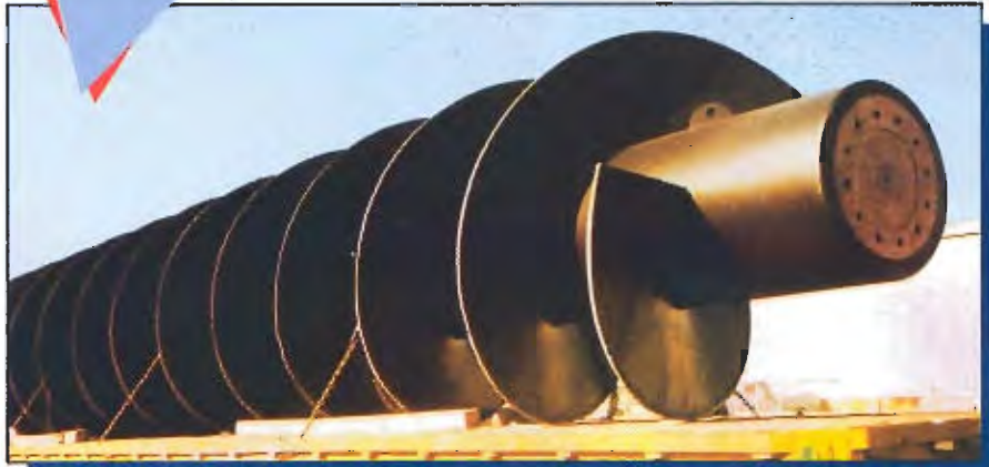
96" dia x 43' 0" lg. Lift Screw