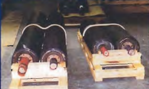
Belt Conveyor Rolls