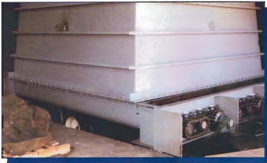
Wood Chip Handling Live Bottom Bin