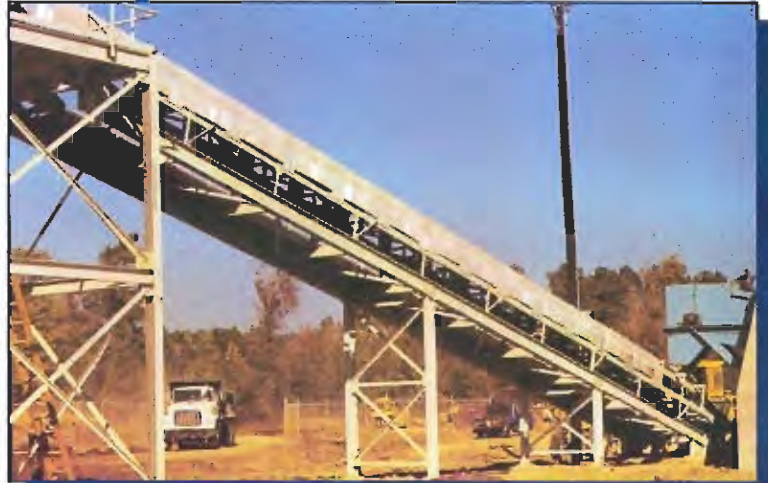
Incline Belt Conveyor