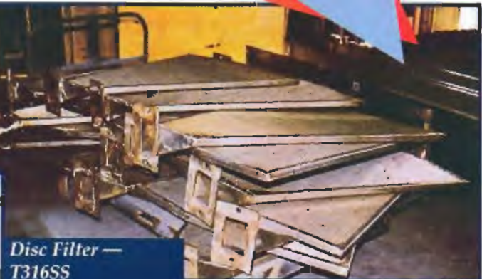
Disc Filter — T316SS