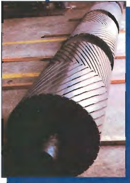
Broke Paper Belt Conveyor Pulley