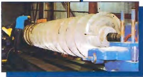
Machining O.D. of Screw 48" dia. x 39' 0" lg. Press Screw