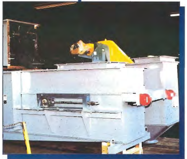
Apron Pan Conveyor