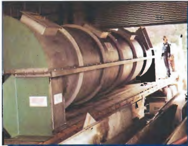
HD-4 Heater Screw Final Inspection

Send for the KWS SCREW CONVEYOR ENGINEERING GUIDE, information-packed pages, free to qualified personnel who use or specify screw conveyor equipment. The Guide contains typical installations of screw conveyors, three chart and artfilled sections on engineering, components and layouts.