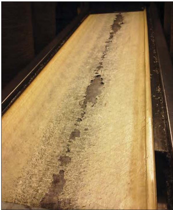
White PVC 120 COS x F