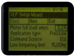
STEP 1: Input Motor's Electrical Specifications

Toshiba stands at the forefront of innovation with our remarkably intuitive and user-friendly startup. In fact, out-the-box, the P9 is only minutes from complete configuration and full optimization of your pump system performance.