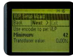
STEP 4: Input VLP Minimum