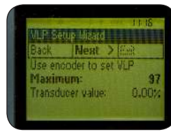
STEP 3: Input VLP Maximum