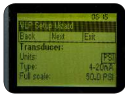
STEP 2: Input Transducer Specifications