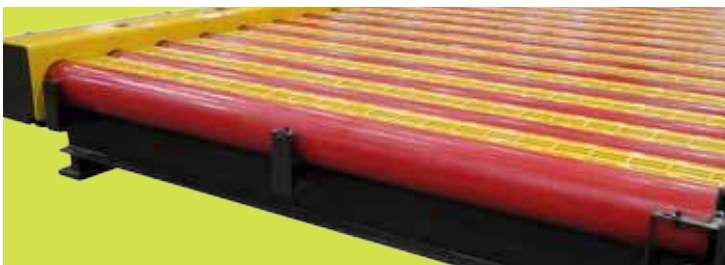
Red Urethane Coated 6" Rollers