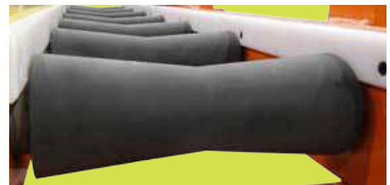
Machined Bow-Tie Profile Millable Urethane Coated Rollers