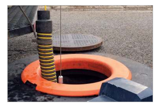
Sewer jet hose and camera protection

Toll Free: 800-343-0428 Email: sales@flexaust.com www.flexaust.com