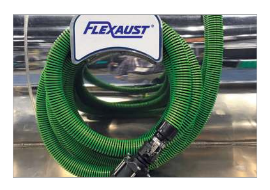
Pumper Truck Vac Hose