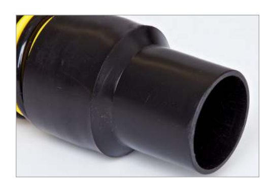
Replacement screw cuffs available